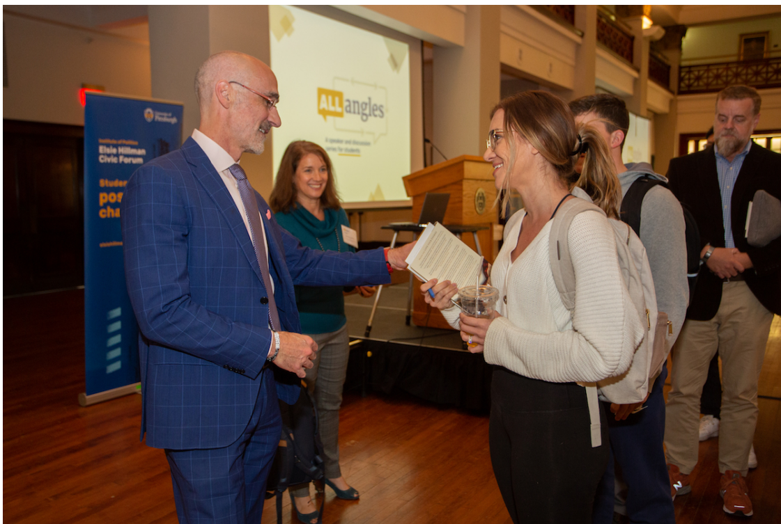
Dr. Arthur C. Brooks - Harvard Professor, Bestselling Author, and The Atlantic Columnist - speaks with students during the September 2022 All Angles program. Read more on PittWire.