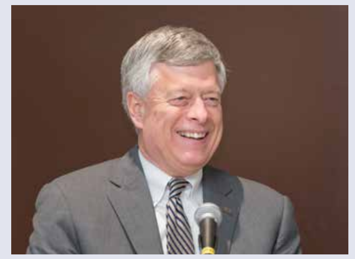
Mark A. Nordenberg

In rural and suburban areas, accessing mental health and substance abuse services can be difficult. This hardship can be made worse for low-income residents due to several other negative impacts of receiving treatment. For example, treatment for these issues can be disruptive to the daily life of low-income patients, many of whom do not have jobs that allow them time off to seek help. In order to better address the needs of residents with mental health or substance abuse issues, increased funding