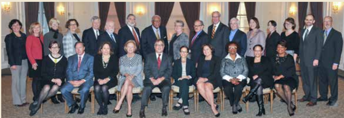
Institute staff members gather with the members of the newly formed Elsie Hillman Civic Forum National Advisory Council.

Elsie Hillman Civic Forum National Advisory Council Meeting page 17